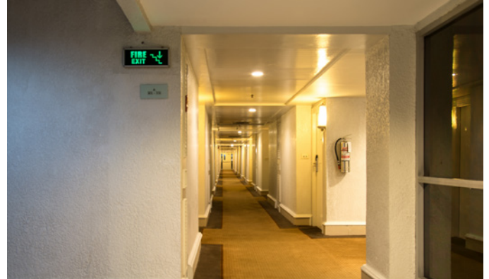
Dimly lit corridors can increase fall risks.