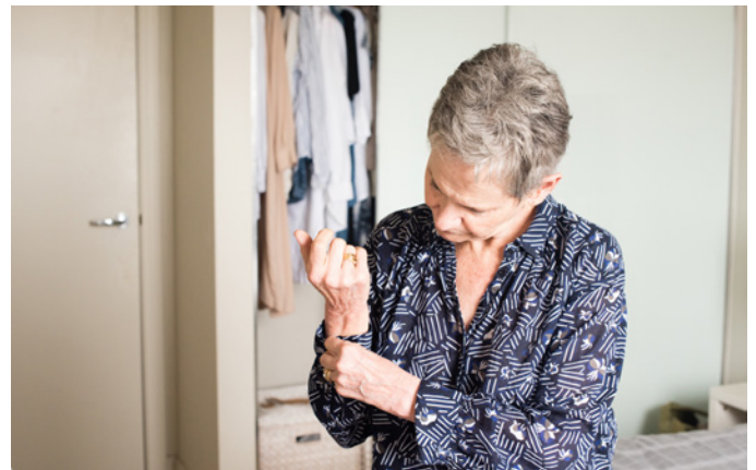
Performing daily tasks may require varied levels of lighting and should be considered on a case by case basis.

When light levels are too low to meet older adults' needs, they may have difficulty performing daily tasks, such as reading (up close or at a distance), sorting medications, and other activities of daily living (ADLs). Poor lighting has a negative impact on older adults' concentration, speed, and task accuracy. Fortunately, there are a number of ways that designers can increase the quality and brightness of lighting in senior living environments in order to better support the functional activities of older adults.