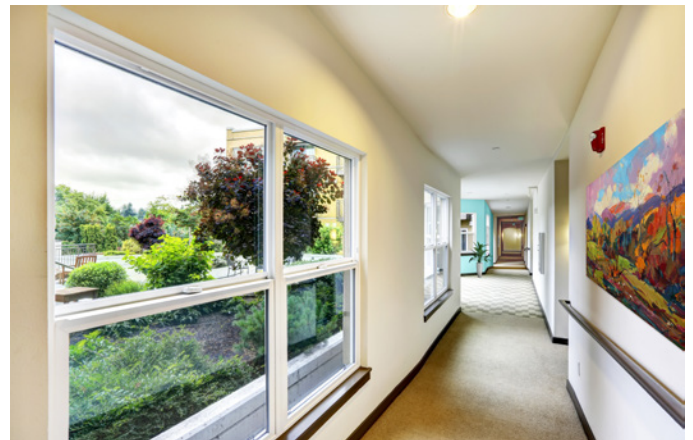
Brightly lit corridors with contrasting finishes can help reduce falls and increase mobility.

The amount of light in nursing homes is seldom sufficient to meet the visual needs of older adults. This lack of illumination may create a higher risk of accidental falls for all residents (De Lepeleire, Bouwen, De Coninck et al., 2007). Fall risk increases with age. When fall risk is combined with naturally declining vision and insufficient interior light levels, senior living communities can become dangerous to their own residents. Appropriately increasing light where falls are most likely to occur can balance resident safety with design intent.